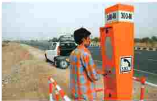
Fig. 7.10 : Emergency call box on NH-48

Digital India is an umbrella programme to prepare India for a knowledge based transformation. The focus of Digital India Programme is on being transformative to realise – IT (Indian Talent) + IT (Information Technology) = IT (India Tomorrow) and is on making technology central to enabling change.