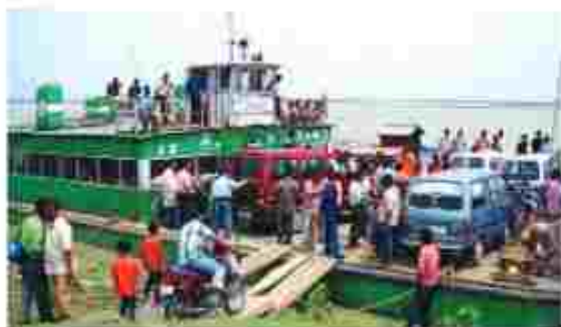
Fig. 7.5: Inland waterways widely used in north-eastern states