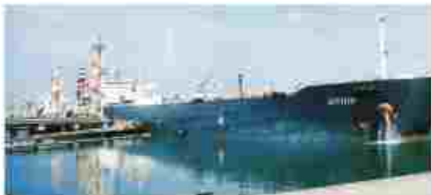
Fig. 7.7: Tanker discharging crude oil at New Mangalore port

Mumbai is the biggest port with a spacious natural and well-sheltered harbour. The Jawaharlal Nehru port was planned with a view to decongest the Mumbai port and serve as a hub port for this region. Marmagao port (Goa) is the premier iron ore exporting port of the country. This port accounts for about fifty per cent of India's iron ore export. New Mangalore port, located in Karnataka caters to the export of iron ore concentrates from Kudremukh mines. Kochchi is the extreme south-western port, located at the entrance of a lagoon with a natural harbour.