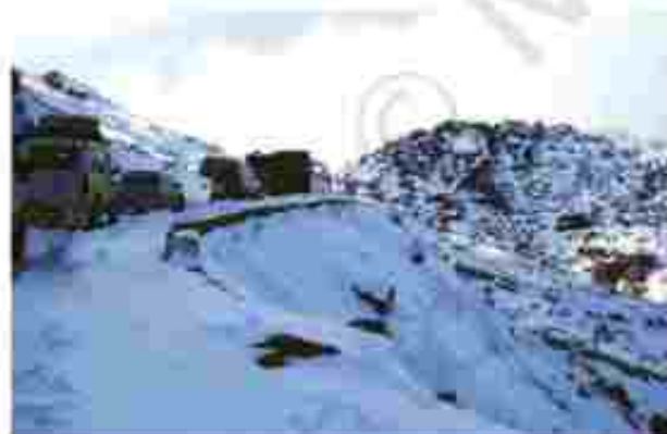
Fig. 7.4: Traffic on north-eastern border road (Arunachal Pradesh)

Roads can also be classified on the basis of the type of material used for their construction such as metalled and unmetalled roads. Metalled roads may be made of cement, concrete or even bitumen of coal, therefore, these are all weather roads. Unmetalled roads go out of use in the rainy season.