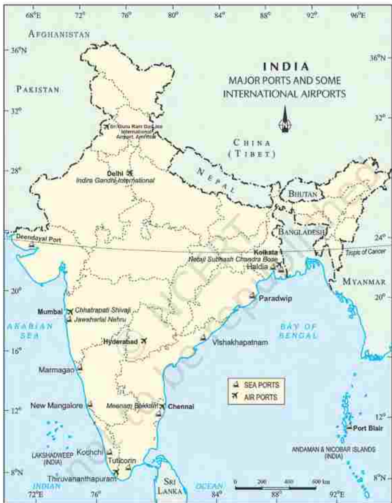
India: Major Ports and Some International Airports