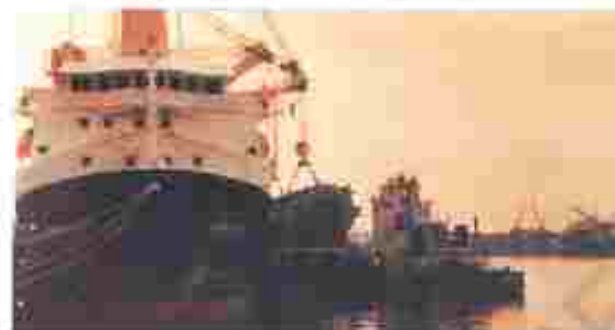
Fig. 7.8: Handling of oversize cargo at Tuticorin port.

even our neighbouring countries like Sri Lanka, Maldives, etc. and the coastal regions of India. Chennai is one of the oldest artificial ports of the country. It is ranked next to Mumbai in terms of the volume of trade and cargo. Vishakhapatnam is the deepest landlocked and well-protected port. This port was, originally, conceived as an outlet for iron ore exports. Paradwip port located in Odisha, specialises in the export of iron ore. Kolkata is an inland riverine port. This port serves a very large and rich hinterland of Ganga-Brahmaputra basin. Being a tidal port, it requires constant dredging of Hoogly. Haldia port was developed as a subsidiary port, in order to relieve growing pressure on the Kolkata port.