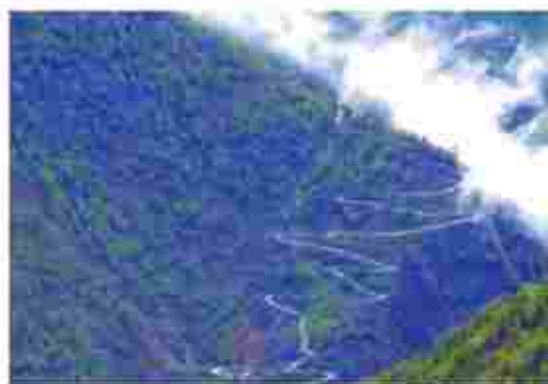
Fig. 7.3: Hilly Tracts