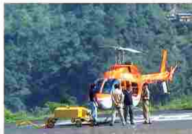
Why is air travel preferred in the north-eastern states?

The air travel, today, is the fastest, most comfortable and prestigious mode of transport.