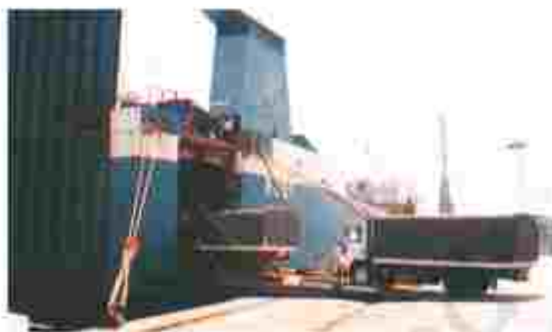
Fig. 7.6: Trucks being driven into the vessel at Mumbai port

Deendayal Port, is a tidal port. It caters to the convenient handling of exports and imports of highly productive granary and industrial belt stretching across UT of Jammu and Kashmir, and the states of Himachal Pradesh, Punjab, Haryana, Rajasthan and Gujarat.