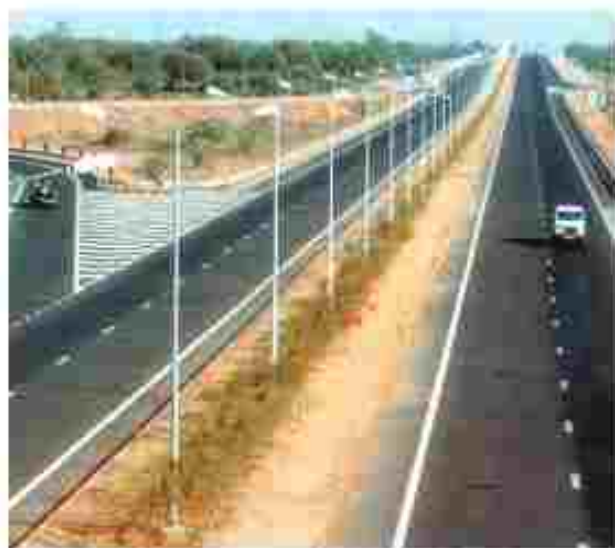
Fig. 7.2: Ahmedabad-Vadodra Expressway